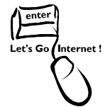
Photo Gallery Component

The photo gallery component makes it easy to set up a page of photos in one of four layouts: horizontal, vertical, montage, and slideshow. Thumbnail images are created automatically and captions can be added. It is a great way to display pictures of a project.